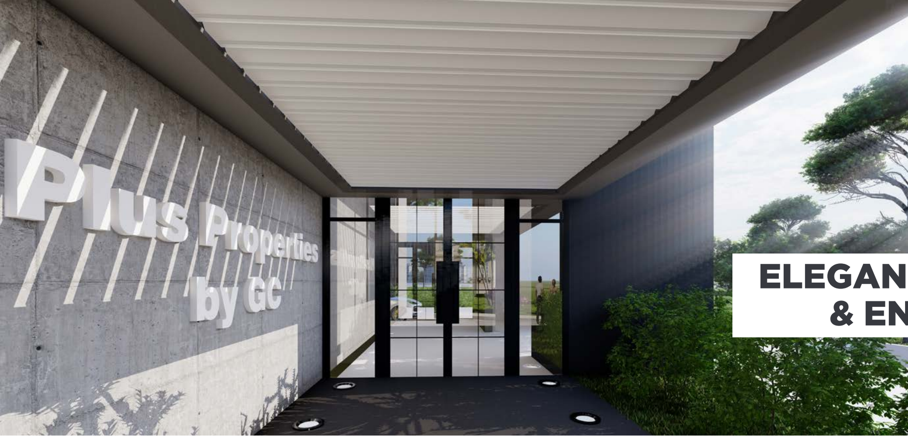
ELEGANT LOBBY & ENTRANCE