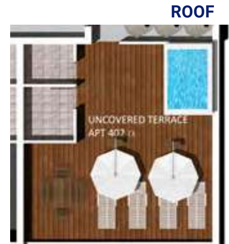
▲ α 402

2 Bedrooms 2 Bathrooms 85 SQM Internal Area 21 SQM Covered Veranda 41.5 SQM Uncovered Veranda