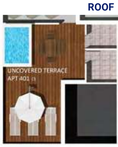
▲ α 401