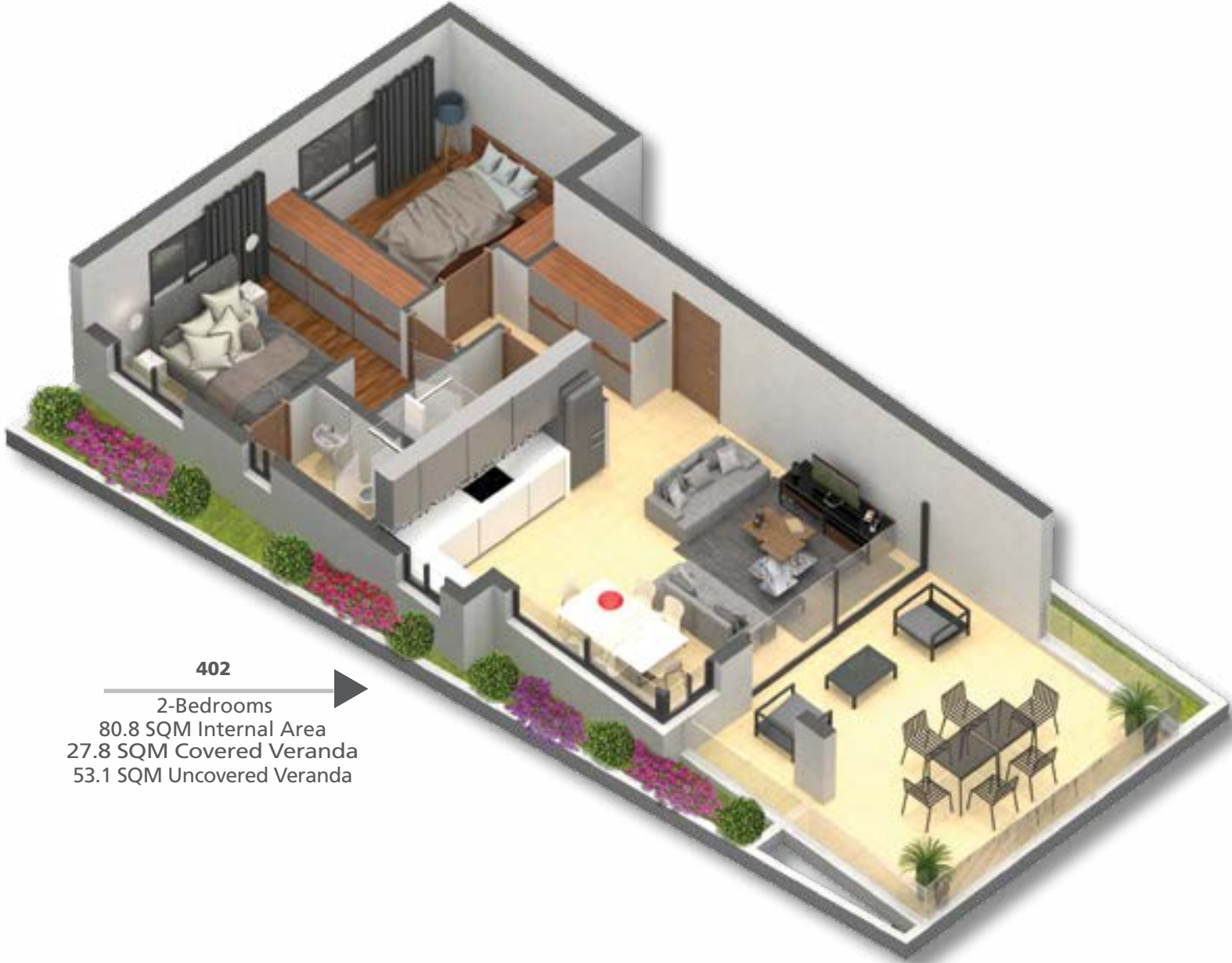
402 2-Bedrooms 80.8 SQM Internal Area 27.8 SQM Covered Veranda 53.1 SQM Uncovered Veranda